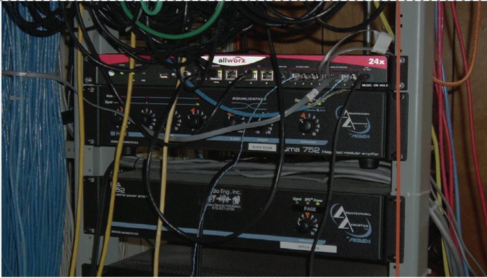
The Allworx 24x installed at CB&K Supply's main office in Janesville, WI.