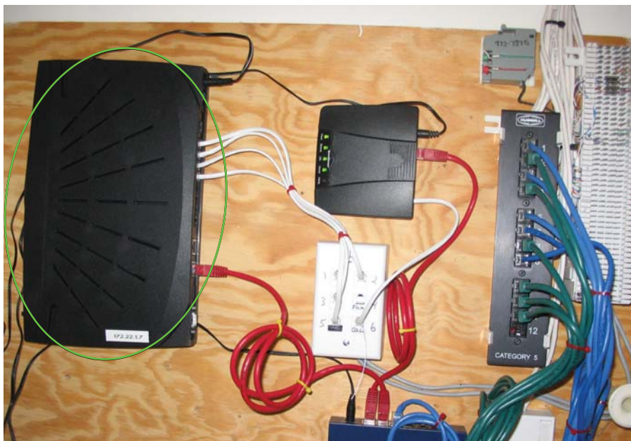
Switching to the Allworx solution has also enabled CVTSA to a great extent reduce all of its long-distance charges, both usage charges and monthly charges.