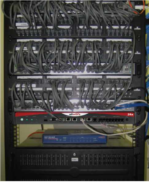
Transonic Combustion's Allworx 24x system on an equipment rack at their Camarillo location.